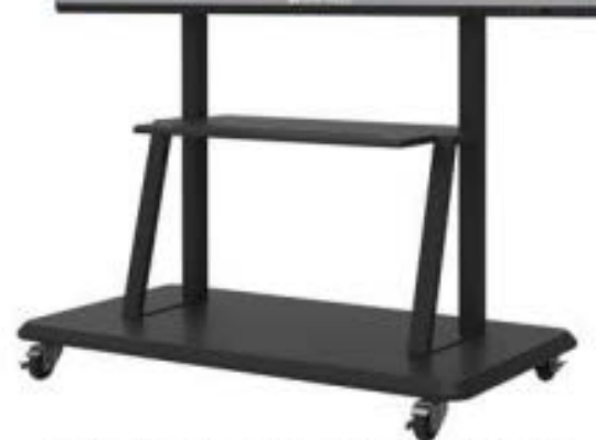
Shown: Clear Touch SIVIDH's Interactive Asset/With Optional Fixed Mobile Stand

AC Power Supply, Quick Start Guide, Writing Pen(s), Remote Control, VGA Cable, Audio Cable, USB Cable, Application Software and Drivers