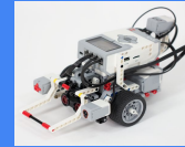
STEM Robotics Kits