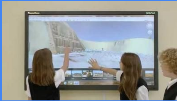
70" Interactive Touchscreens