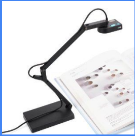
USB Document Cameras